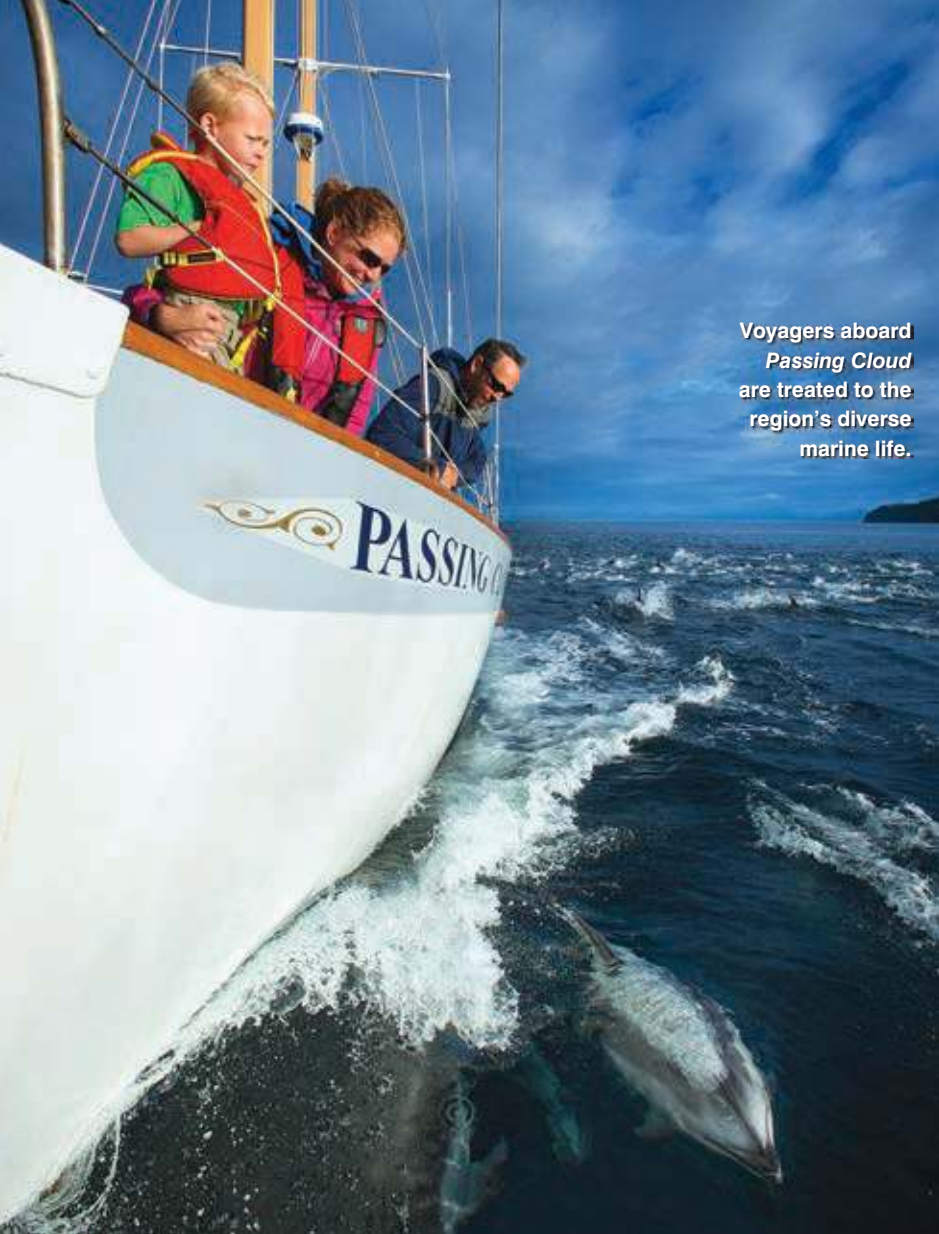
Voyagers aboard Passing Cloud are treated to the region's diverse marine life.