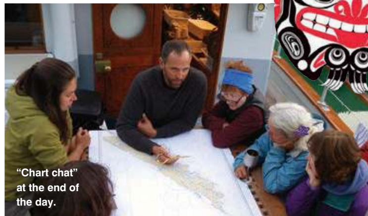
“Chart chat” at the end of the day.