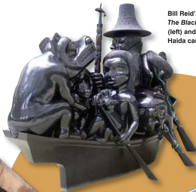
Bill Reid's sculpture The Black Canoe (left) and a modern Haida canoe.

Two castings were made. One, known as The Jade Canoe , greets travelers at the international wing of Vancouver International Airport. The Black Canoe is the only outdoor work of art displayed at the Canadian Embassy in Washington, D.C., near the Capitol. ■